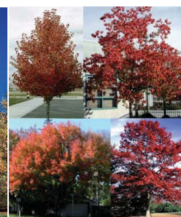
D: Deciduous tree with good autumn colour