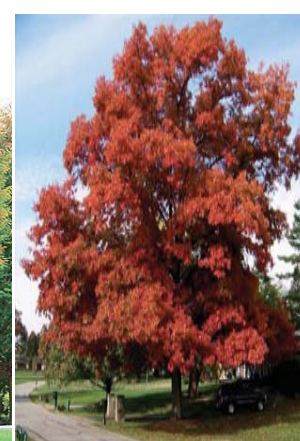
Q1: Quercus coccinea (Scarlet Oak)