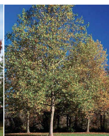
P: Platanus acerifolia (Plane tree)