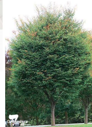
Z: Zelkova serrata (Green Vase)