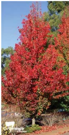
P1: Pyrus calleryana 'Glen's form'