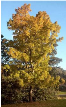
F: Fraxinus angustifolia (desert ash)