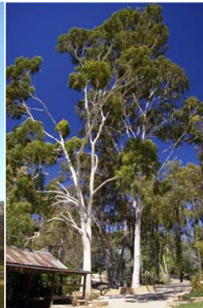
E1: Corymbia citriodora (lemon scented gum)