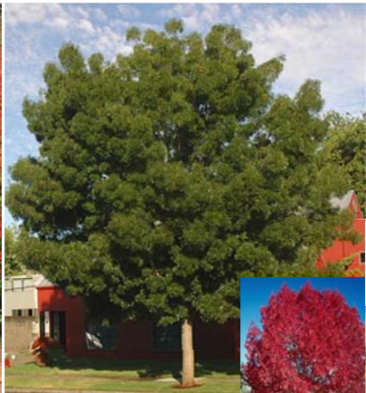
R: Fraxinus oxycarpa Raywood (claret ash)