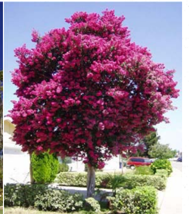
L: Lagerstroemia indica hybrid (crepe myrtle)

project: ADELAIDE ROAD & KEITH STEPHENSON PARK drawing: HAWTHORN RD TO CORNERSTONE COLLEGE