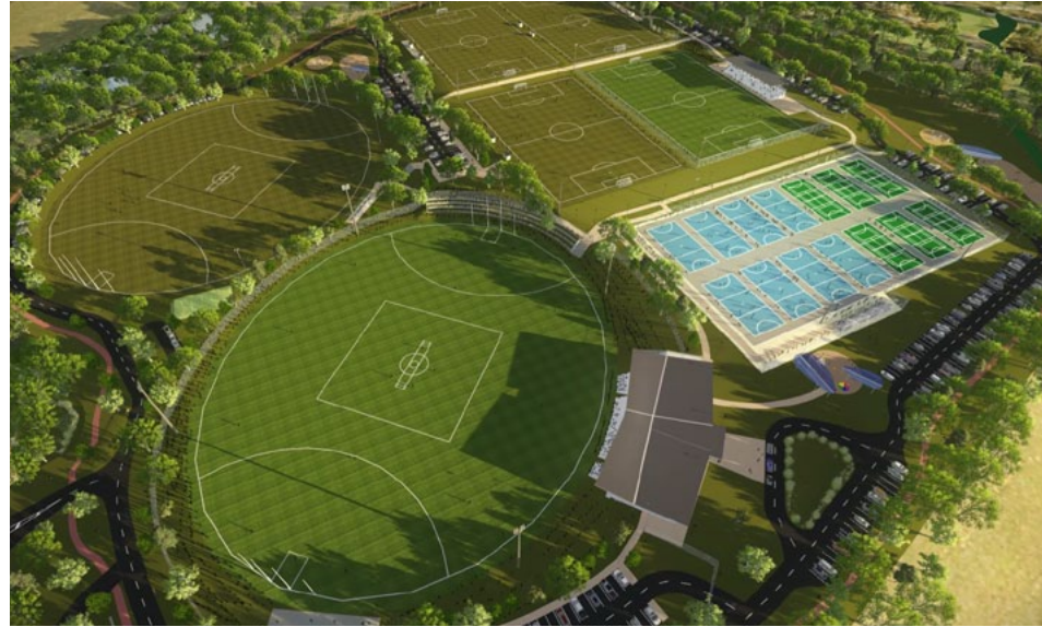
Proposed sporting hub to complement existing facilities

Perfectly nestled in the heart of the Mount Lofty Ranges, Mount Barker is central to a range of sporting, recreational and leisure opportunities and facilities.